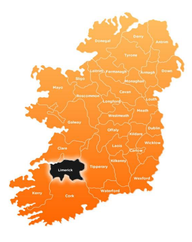
Villiers IB School

The Summer Residential programme in Limerick is based in Villiers International IB School. This prestigious school is one of Ireland's oldest and established private boarding schools, modernised with onsite residential accommodation, dining halls, indoor and outdoor sports facilities, a large open garden area all within a beautiful gated enclosure in a scenic area of the city.